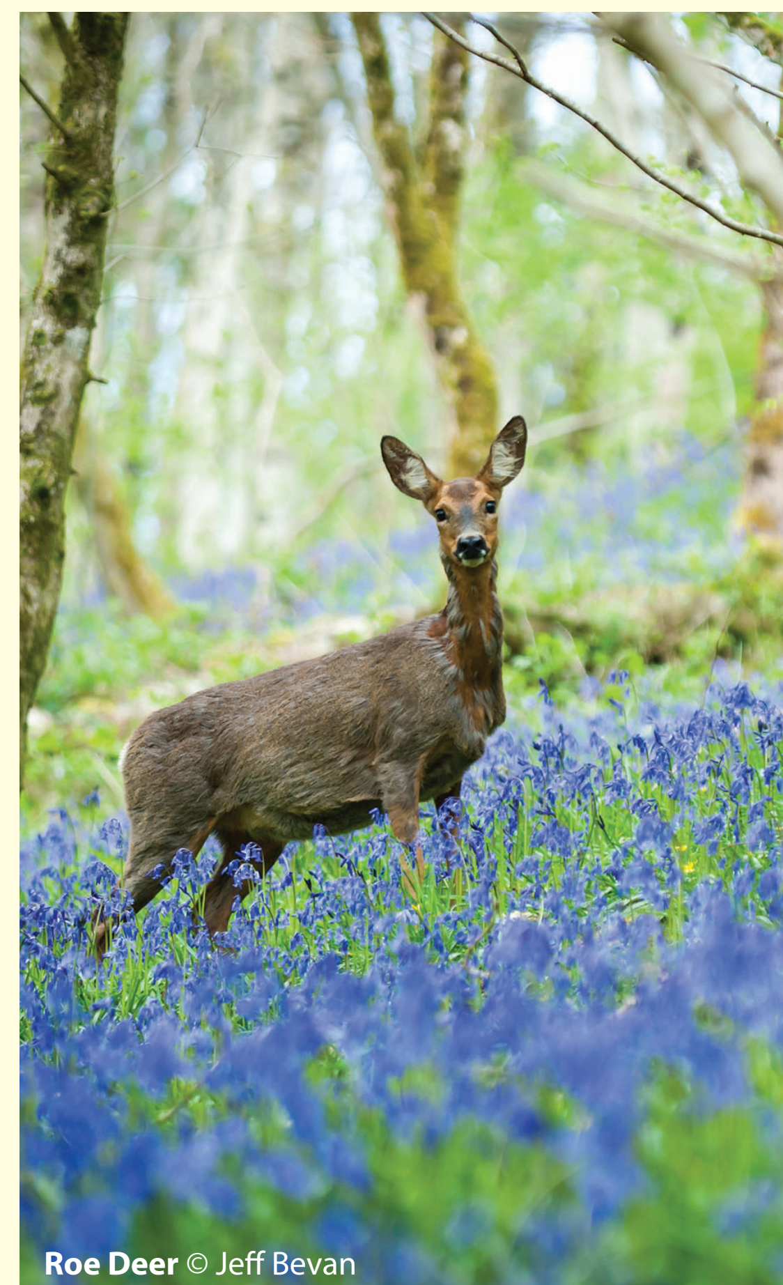
Roe Deer