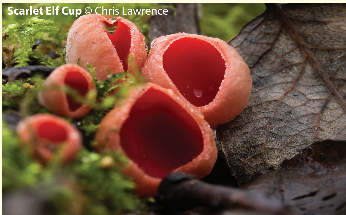
Scarlet Elf Cup

Long Wood is a 17 hectare (42 acres) nature reserve and Site of Special Scientific Interest (SSSI). It is one of Somerset Wildlife Trust's oldest nature reserves having been leased from Bristol Water in 1969, until it was purchased in 1998.