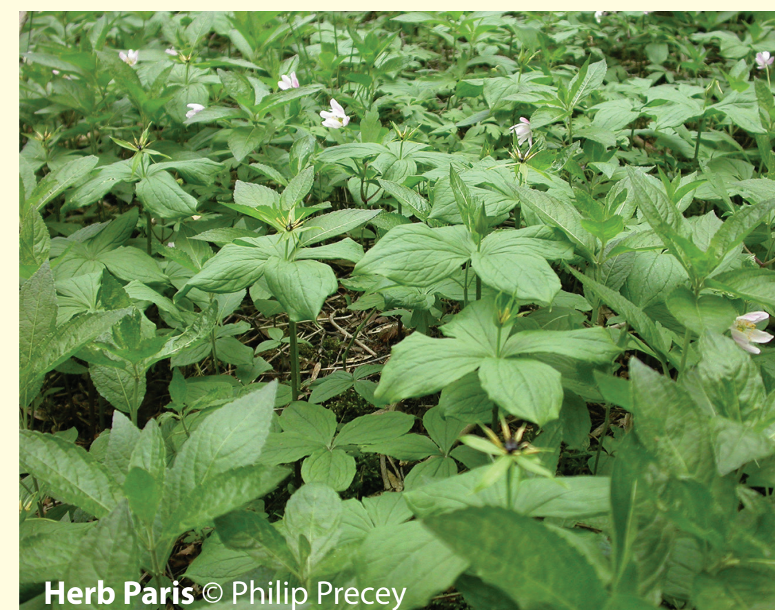
Herb Paris